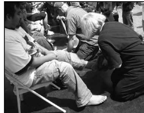
Washing feet of recent immigrants

In Georgia, the struggle for immigration reform seems hopeless. I think of the fishes and loaves story where Jesus tells the confused and anxious disciples to feed the crowd themselves. Ulti-