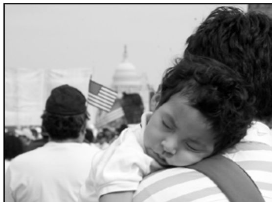
Family at immigration rally at U.S. capitol

The concept of authentic development applies to those of us in the developed world as much