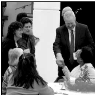
Mayor McGinn greets women

We are seeking your input to plan programs to further our interfaith relationship building.