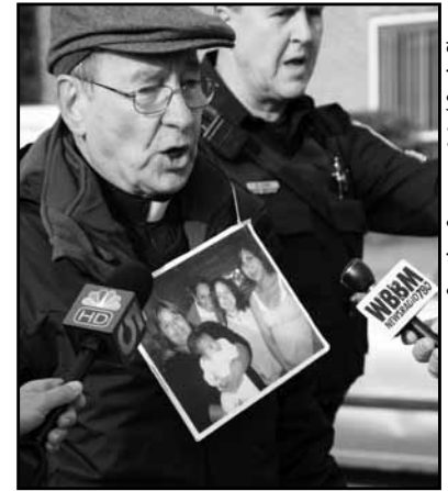
Under arrest at detention center protest

As a result of concerted advocacy, litigation, grassroots organizing and media attention, ICE acknowledged in 2009 that the detention system is fundamentally broken. The agency promised a range of reforms to move away