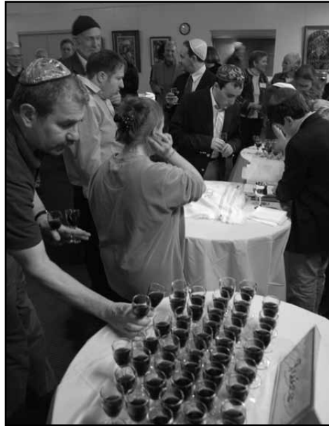
Temple Beth Am