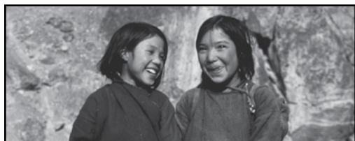
The Economics of Happiness

Join us for a social justice film, discussion & refreshments