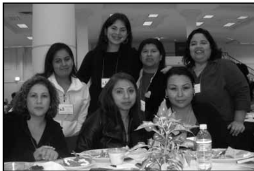
Participants at Latinas Connected for Change

Hope and determination led to unprecedented successes. First, the city of Seattle gave us their total support and the Seattle Center lent us their Exhibition Hall. Then, the Children’s Museum offered to help with childcare, sponsoring 100 children from low-income families and their chaperones to spend the day of the conference at the museum. Presenters donated their time and talents. Latino organizations and media supported the project and helped with promotion.