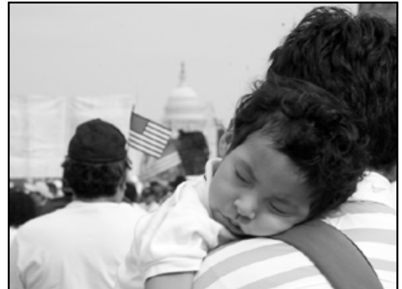
Family at immigration rally at U.S. capitol

The concept of authentic development applies to those of us in the developed world as much