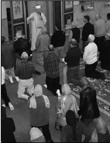
Mosque & Islamic Center in Shoreline