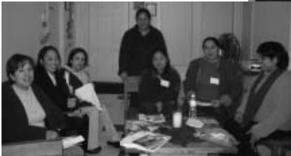
Renton Women's Justice Circle

Seattle—Cristo Rey Parish , meeting with legislators about the "Dream Act" and immigrant rights issues.