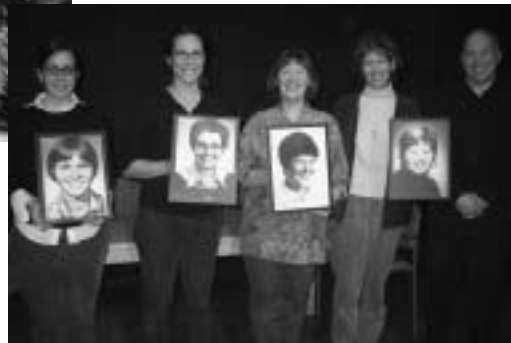
Cast of Same Fate as the Poor