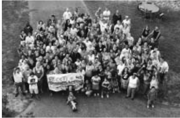
Nearly 400 people gathered for the Western States Center's 2005 "Community Strategic Training Initiative" in Oregon. At this annual three-day gathering, community activists from all over the Northwest learn how to become more effective social changers.