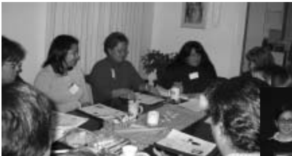
Toppenish Women's Justice Circle

Seattle—Jubilee Women's Center , addressing the root cause of lack of access to housing by designing an advocacy process on living wage that involves low-income women.