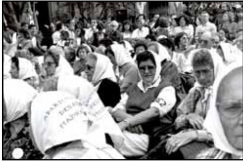
Mothers of the Disappeared

Reader: We remember Argentina's Mothers of the Disappeared who refused to be silenced by fear and oppression. Raising their voices on behalf of their missing children, these brave women empowered others to speak out about human rights abuses and work for democratic reforms.